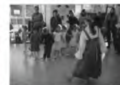
I didn't get my first big culture shock until I had been living in London for about 10

the world, became a foundation of AZBUKA org – Russian nursery, school and Club.